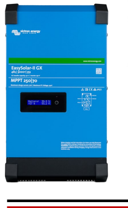
Easysolar48/3000 x 1