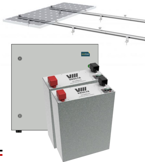
K34.150.03 + 2 x 5KWh