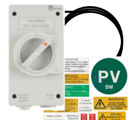
Isolator + Extras